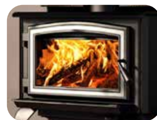
Door Overlay, Brushed Nickel OA10250