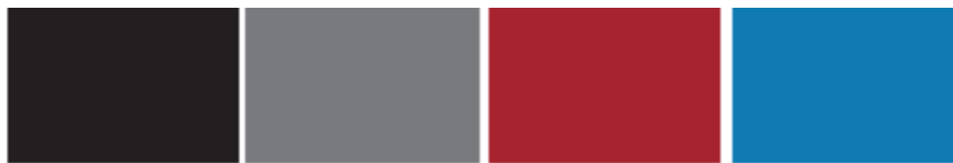
Interchangeable Side and Top Panels