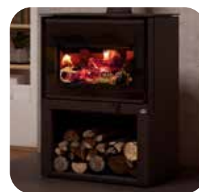
Steel Base Kit

Refractory Panel Kit Goes inside the stove to give a contemporary look.