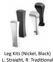
Leg Kits (Nickel, Black) L: Straight, R: Traditional