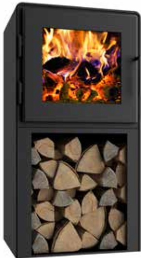
Nova with Black Satin Door and Tower Pedestal