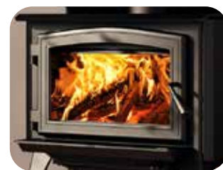
Door Overlay, Black OA10249