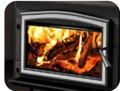
Door Overlay, Brushed Nickel OA10164