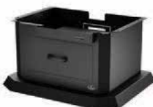
Pedestal with Ash Pan