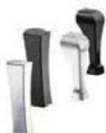
Leg Kits (Nickel, Black) Left: Straight, Right: Traditional