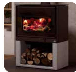
Soapstone Base Kit