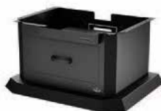
Pedestal with Ash Pan