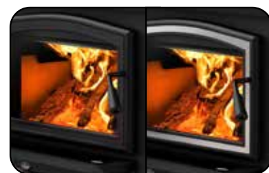
Door Overlays Black, Brushed Nickel