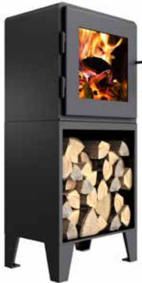
Nova with Black Satin Door, Tower Pedestal and Tower Leg Kit