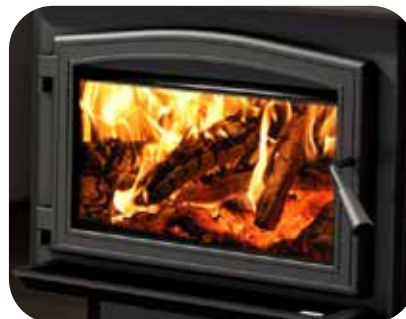
Door Overlay, Black OA10163