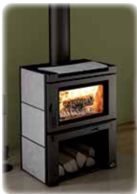
Matrix Wood Stove with Soap Stone Side & Top Panel Kit