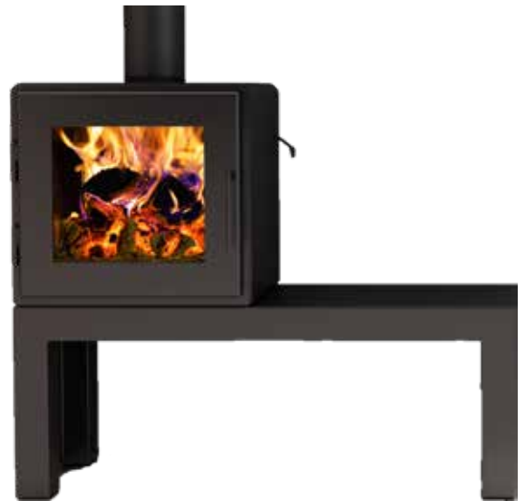
Nova with Black Satin Door and Bench