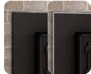
Faceplate Trim Kit Black, Brushed Nickel