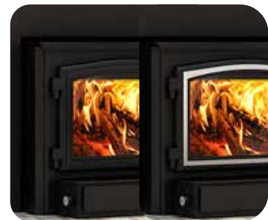
Door Overlays Black, Brushed Nickel