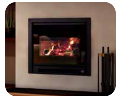
Faceplate 3-Sided Narrow