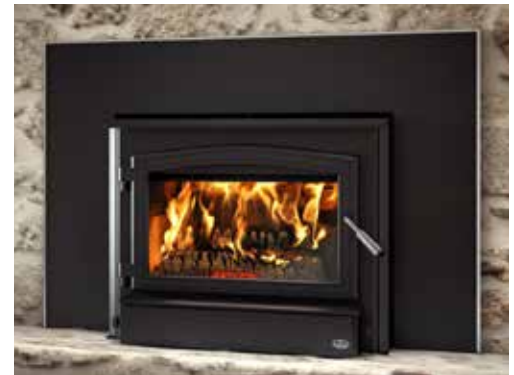
Black Door Overlay with Brushed Nickel Faceplate Trim