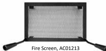
Fire Screen, AC01213