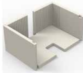
Refractory Panel Kit AC01237