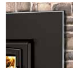
Faceplate Trim Kit, Brushed Nickel