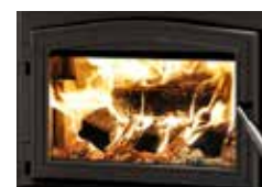
Door Overlay, Black