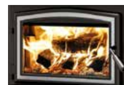
Door Overlay, Brushed Nickel