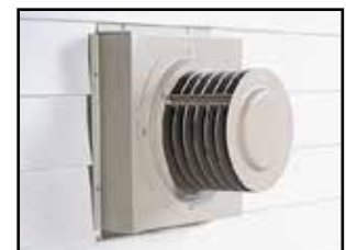
DV-822 Vinyl Siding Vent Kit

Clean and cost-efficient comfort make the DV-210 and DV-215 the perfect heaters to warm your smaller rooms. The slim, compact design allows the heater to tuck out of the way on an outside wall. Quiet burners, a "matchless" piezo ignition, and all the safety features you expect from Empire Comfort Systems come standard.