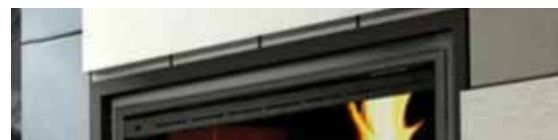
Straight Narrow Face Overlay