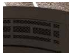
Mission Style Louvers