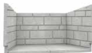
Refractory Molded Brick Panels AC02360

*See Installation Manual for complete installation requirements.