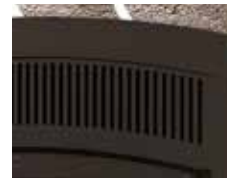
Urban Style Louvers