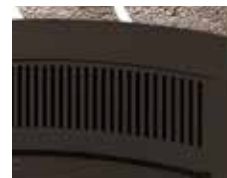
Urban Style Louvers