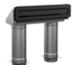
Hot Air Gravity Distribution Kit Modern w/ Adj Pipes AC01389