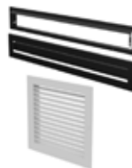
Warm Air Circulation Grill AC01378