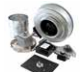
Forced Air Distribution Kit AC01374