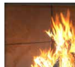
Contemporary Brick VA7071M