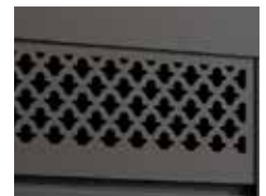
Arabesque Style Louvers