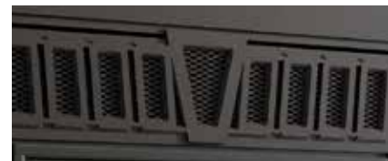
Crown Style Louvers