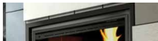
Straight Narrow Face Overlay