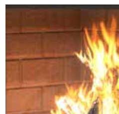
Classic Brick VA7071BR

*See Installation Manual for complete installation requirements.