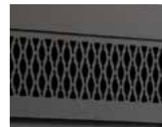
Classic Style Louvers