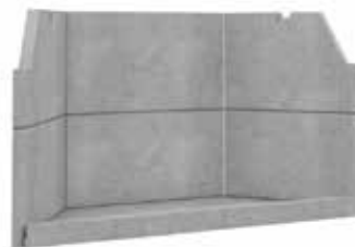
Refractory Brick Kit VA16071M

*See Installation Manual for complete installation requirements.