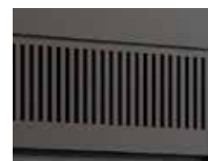
Urban Style Louvers