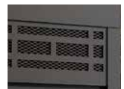
Mission Style Louvers