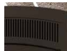
Urban Style Louvers