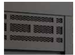
Mission Style Louvers