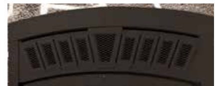
Crown Style Louvers