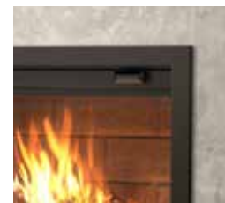
Narrow Overlap Trim Kit VA7E06