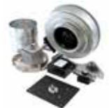
Forced Air Distribution Kit AC01374