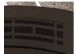
Mission Style Louvers