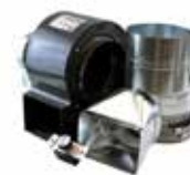
Forced Air Distribution Kit VA4460