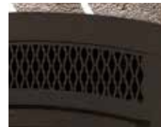
Classic Style Louvers