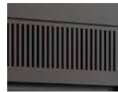
Urban Style Louvers