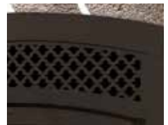
Arabesque Style Louvers