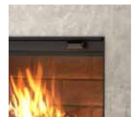
Masonry Trim Kit VA7DTR