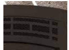
Mission Style Louvers