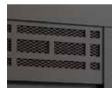
Mission Style Louvers