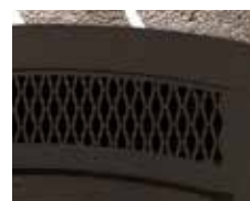
Classic Style Louvers