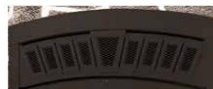
Crown Style Louvers