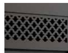
Arabesque Style Louvers