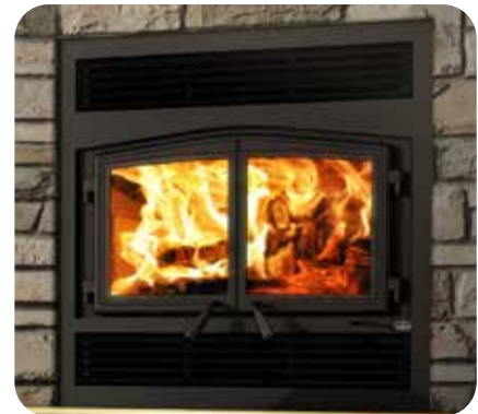
Black Door Overlay (OA10610) & Traditional Style Faceplate (OA10255)