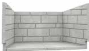
Brick Panels AC02360