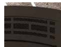
Mission Style Louvers