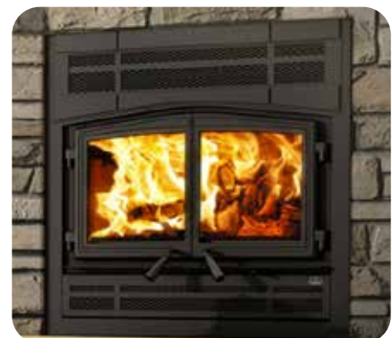
Black Door Overlay (OA10610) & Modern Faceplate (OA10256)