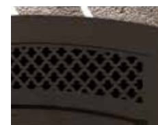
Arabesque Style Louvers