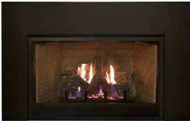
3-Sided Metal Surround and Brick Liner