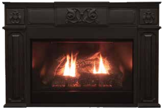
Cast Iron Surround