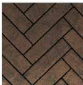
Red Herringbone Brick