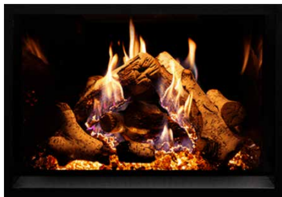
Birch Log Set