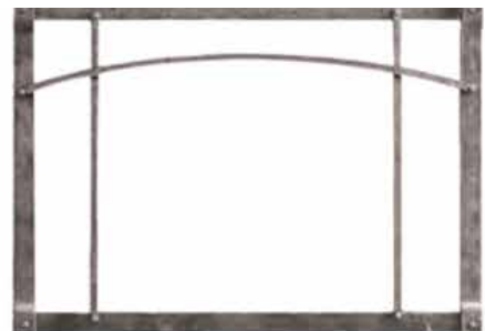
Forged Iron Front w/ Arched Inset (Front and Inset Sold Separately)