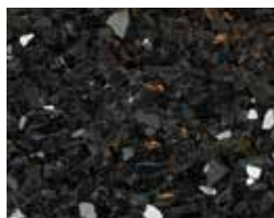
Glass, Black Polished