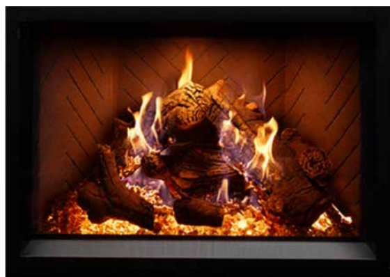
Oak Log Set