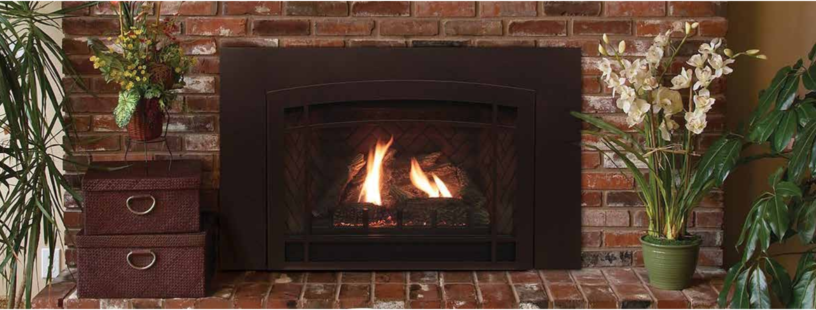
Shown with Lancaster Front