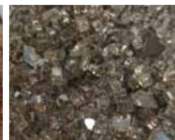
Glass, Bronze Reflective