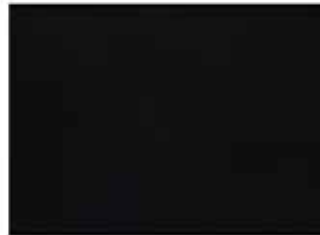
Black Ceramic Glass