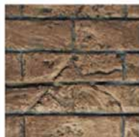
Firecracked Red Brick