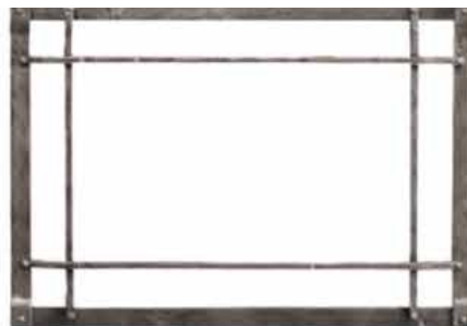
Forged Iron Front w/ Rectangle Inset (Front and Inset Sold Separately)