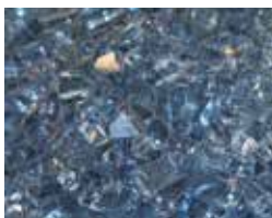
Glass, Blue Clear