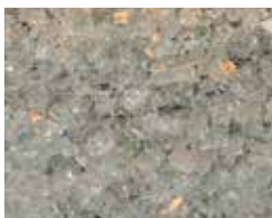
Glass, Clear Frost