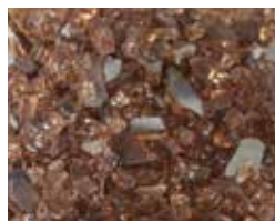
Glass, Copper Reflective