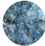
Sky Blue EG25-R04MP