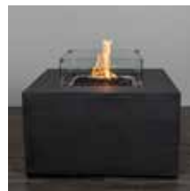
42" Square LP (Shown with Wind Guard)