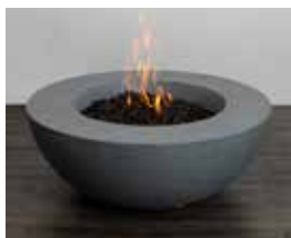
42" Bowl NG