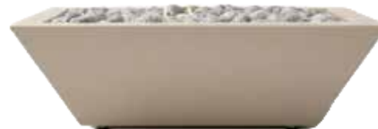
Pinnacle Square Wok

New from Warming Trends, architectural metal woks bring a sleek, sophisticated silhouette to your landscape design. Ascend Round Woks and Pinnacle Square Woks come in two sizes and five colors. Perfect for pillars and posts. Match Light or 12V Cobalt Electronic Ignition makes them ideal for poolside applications.