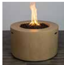
42" Round LP