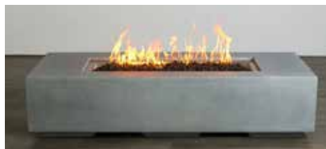
Available in 55" & 72" Rectangle NG