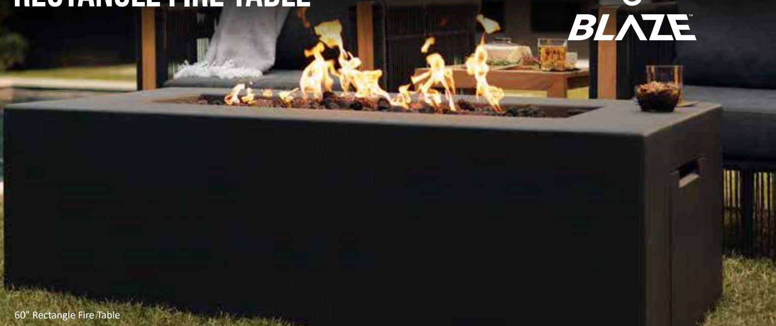
60" Rectangle Fire Table