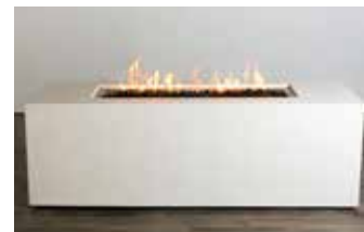
Available in 55" & 72" Rectangle LP

Emilyrose Fire Tables are individually hand-cast by Artisans using GFRC construction for long-lasting strength. Weather-resistant finish resists cracking and fading.