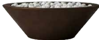
Ascend Round Wok