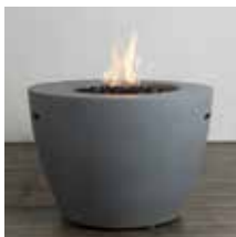
42" Bowl LP