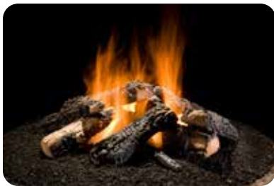
Wilderness Char Fire Pit Log Set