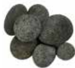
Tumbled Lava Stone, Large 2" - 3", 50 lb Bag