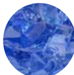
Ocean Blue EG25-L05MP