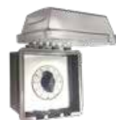
12 Hour Dial DT12HRNB