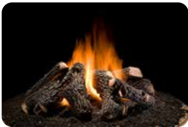
Wilderness Oak Fire Pit Log Set