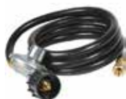
LP Regulator with Hose - LPRH