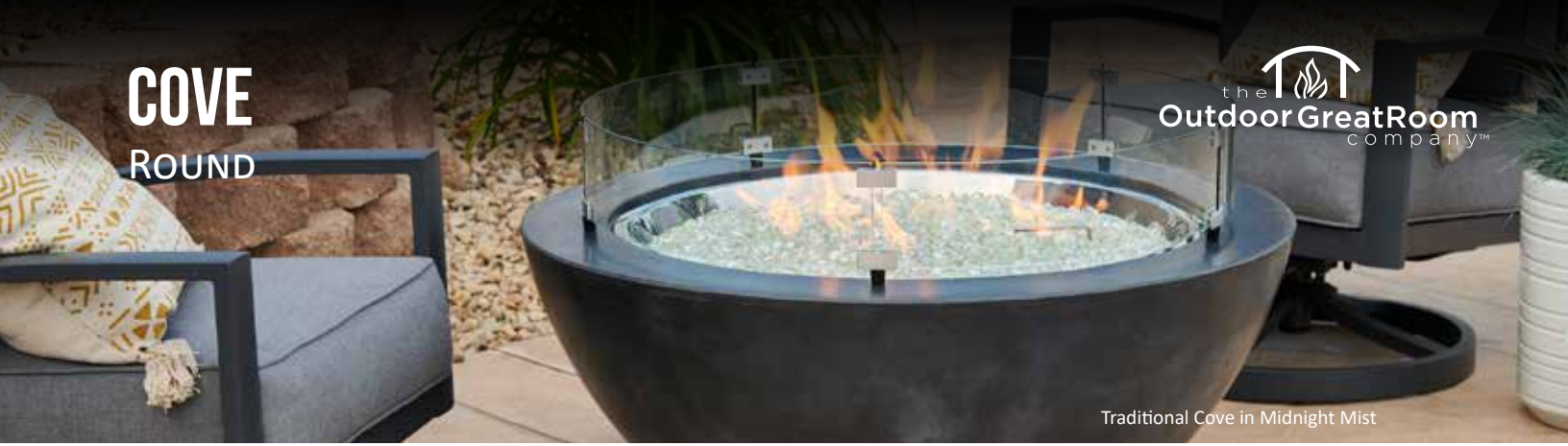
Traditional Cove in Midnight Mist