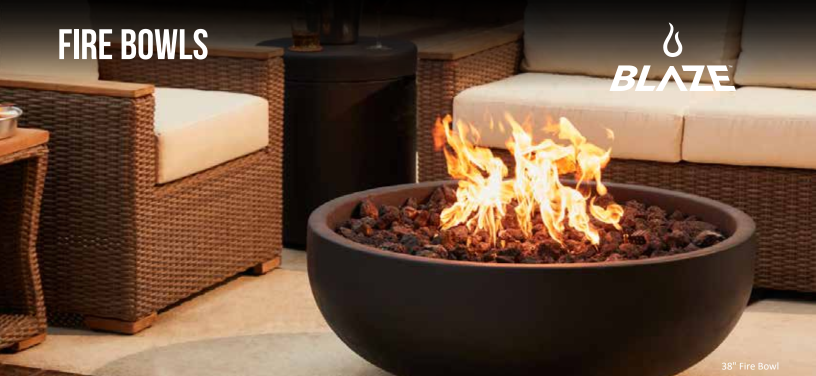
38" Fire Bowl