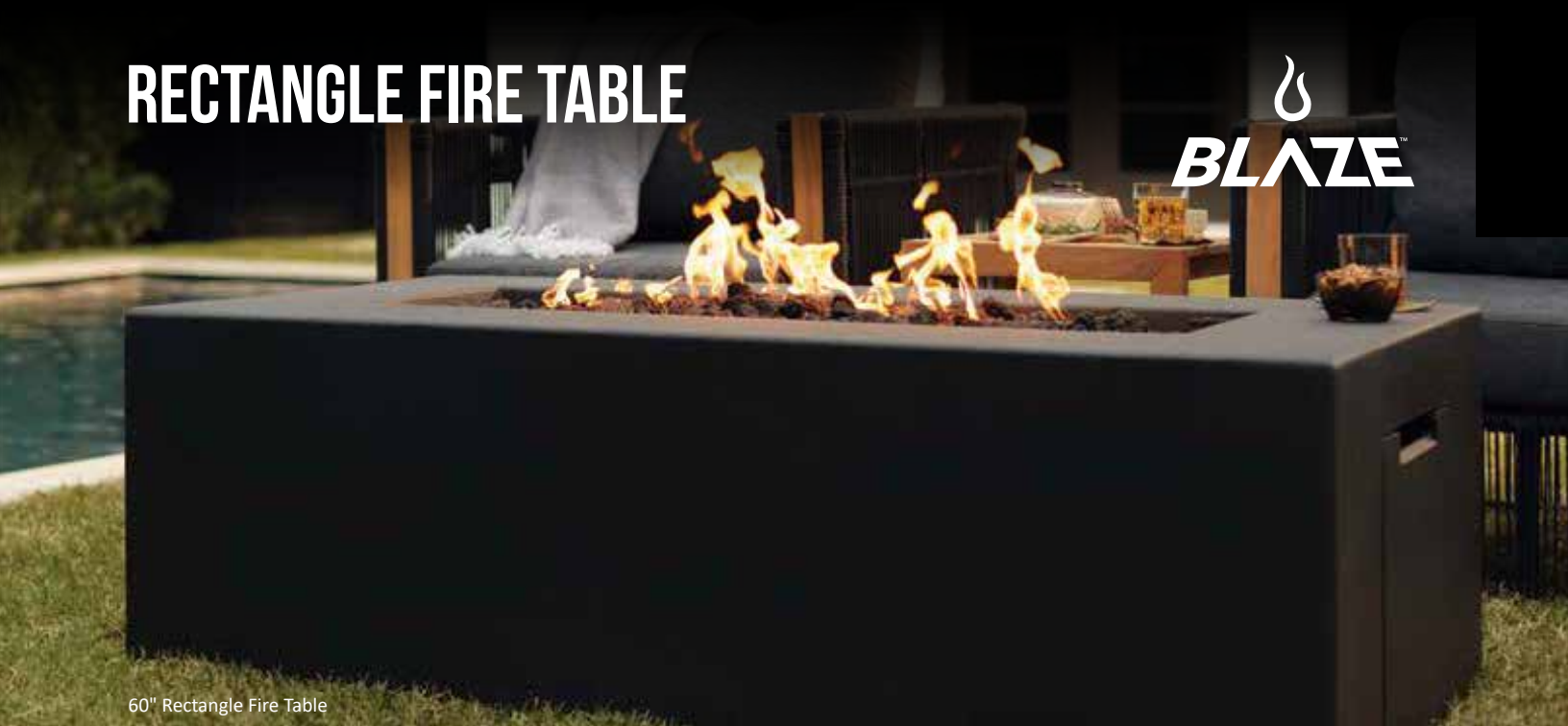
60" Rectangle Fire Table