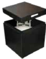
Propane Tank Enclosure

Works with Any Size Table. Lid Included. Choose Color.