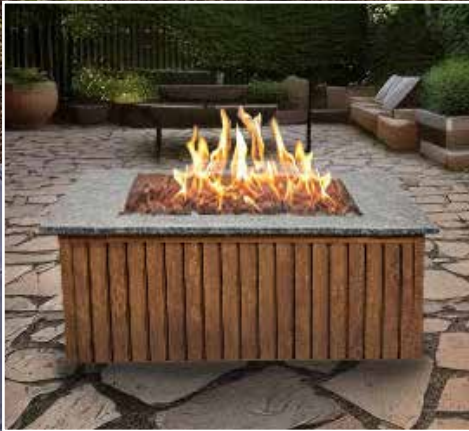
Planks can be aligned vertically or horizontally.