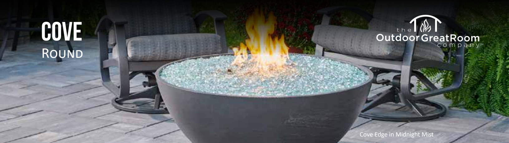
Cove Edge in Midnight Mist