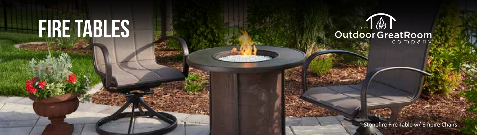
Stonefire Fire Table w/ Empire Chairs

Outdoor GreatRoom Fire Pit Tables are made from powder-coated aluminum framing and include gas burners and burner covers, Diamond Crystal Fire Gems, and ship ready for connection to a 20 lb. propane tank which conceals in the base (tank not included). NG orifice included for conversion.