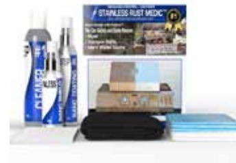
Stainless Steel Rescue Kit 1024