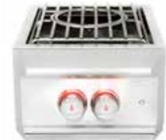
PRO POWER BURNER BLZ-PROPB