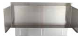
Wind Guard BLZ-PROWG