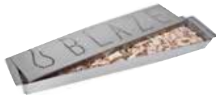
Smoker Box BLZ-SMBX