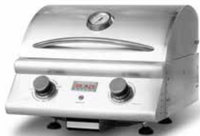
Electric Grill BLZ-ELEC-21