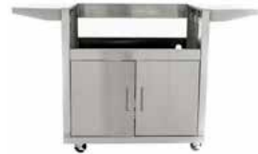
Cart Double door w/locking casters and fixed side shelves.