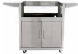
Cart Double door w/locking casters and fixed side shelves.