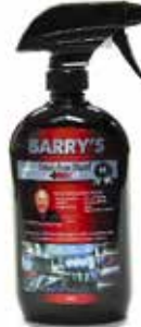
Stainless Steel Rescue Spray 1009