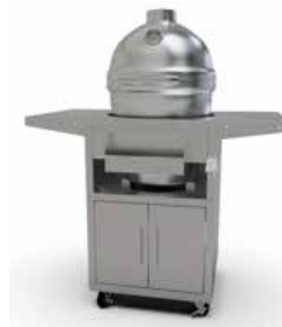
KAMADO GRILL ON CART