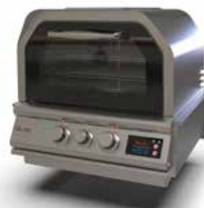
Pizza Oven Built-In