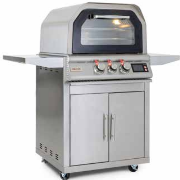
Pizza Oven with Cart