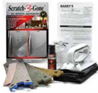
Scratch-B-Gone Homeowner Kit 1001