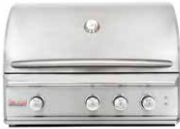
34" PRO GRILL - 3 BURNER BLZ-3PRO