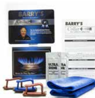
Collar Rescue Kit 1006