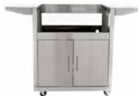
Cart Double door w/locking casters and fixed side shelves.