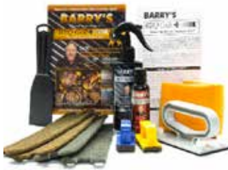
BBQ Grill Rescue Kit 1005