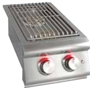
DOUBLE SIDE BURNER BLZ-SB2LTE