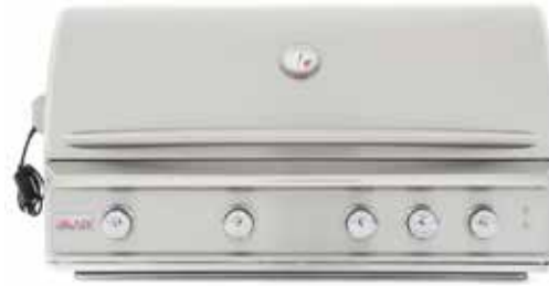
44" PRO GRILL - 4 BURNER BLZ-4PRO