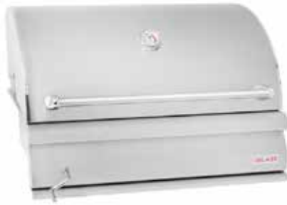
TRADITIONAL CHARCOAL GRILL