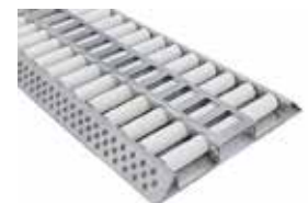
Ceramic Flame Tamer BLZ-CRM-TMR