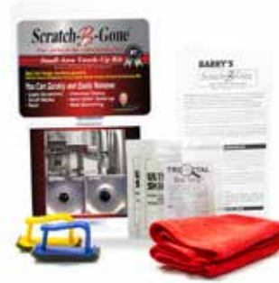
Scratch-B-Gone Small Area Touch-Up Kit 1002