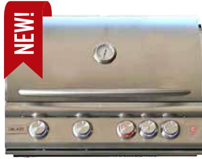
LTE3 MARINE GRADE