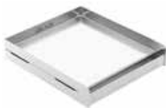
Griddle Plate BLZ-14-SSGP