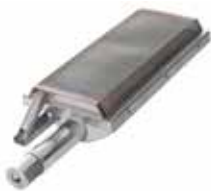
Infrared Searing Burner BLZ-IR