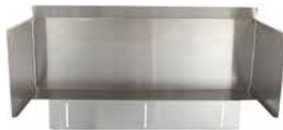
Wind Guard BLZ-WG-25