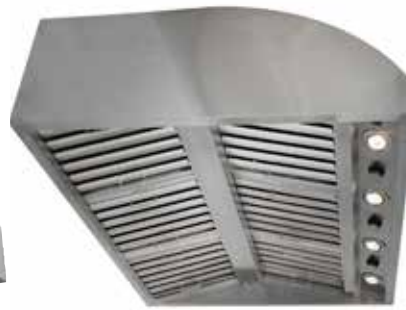
Vent Hood showing Lights