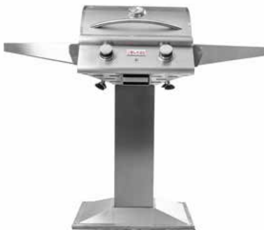
Electric Grill w/ Pedestal BLZ-ELEC-21 & BLZ-ELEC21-BASE