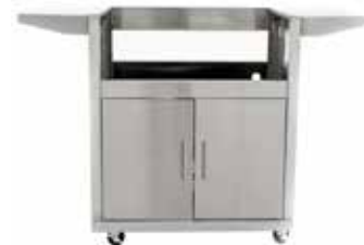
Cart Double door w/locking casters and fixed side shelves.