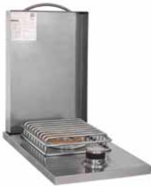
SINGLE SIDE BURNER BLZ-SB1

LP Burners come set up for 20 lb propane tanks. When using bulk propane you must order BLZ-32-050 Low Pressure Regulator.