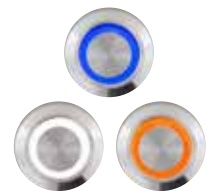
LED Light Kit (LTE2) Blue, White, Amber