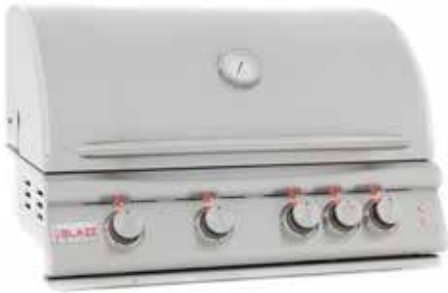
LTE2 MARINE GRADE