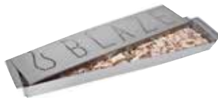
Smoker Box BLZ-SMBX