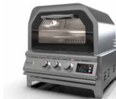
Pizza Oven with Table Top Sleeve