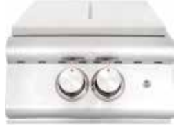
LTE POWER BURNER BLZ-PBLTE

LP Burners come set up for 20 lb propane tanks. When using bulk propane you must order BLZ-32-050 Low Pressure Regulator.