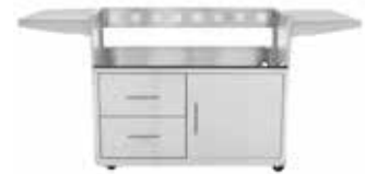
Cart 2 Drawers with internal LED Lights, Single Door, Locking Casters and Folding Side Shelves.