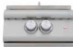
LTE POWER BURNER BLZ-PBLTE3