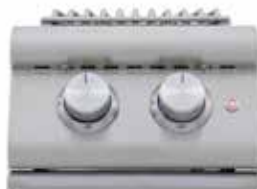
DOUBLE SIDE BURNER BLZ-SB2LTE3