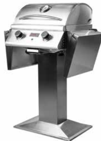
Electric Grill w/ Pedestal showing folded sides