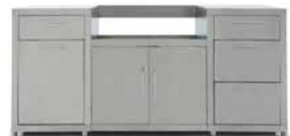
Blaze 6' Stainless Steel Island 34 3/4"H x 72 1/4"W x 22 1/2"D