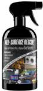
All Surface Rescue Spray 1011