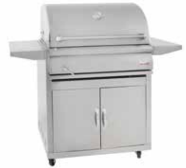
GRILL ON CART