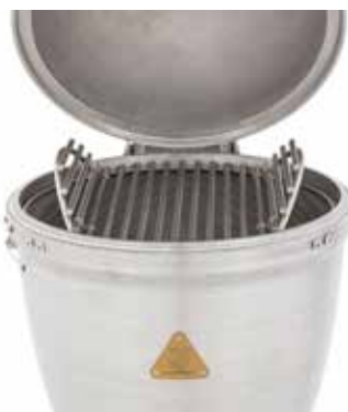
Hinged Cooking Surface