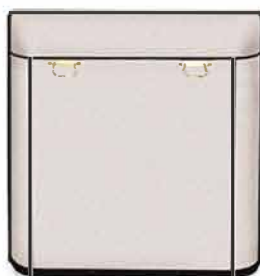
SG Spark Guard (Traditional)