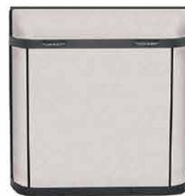
SIG Spark Guard (Shown with trim)