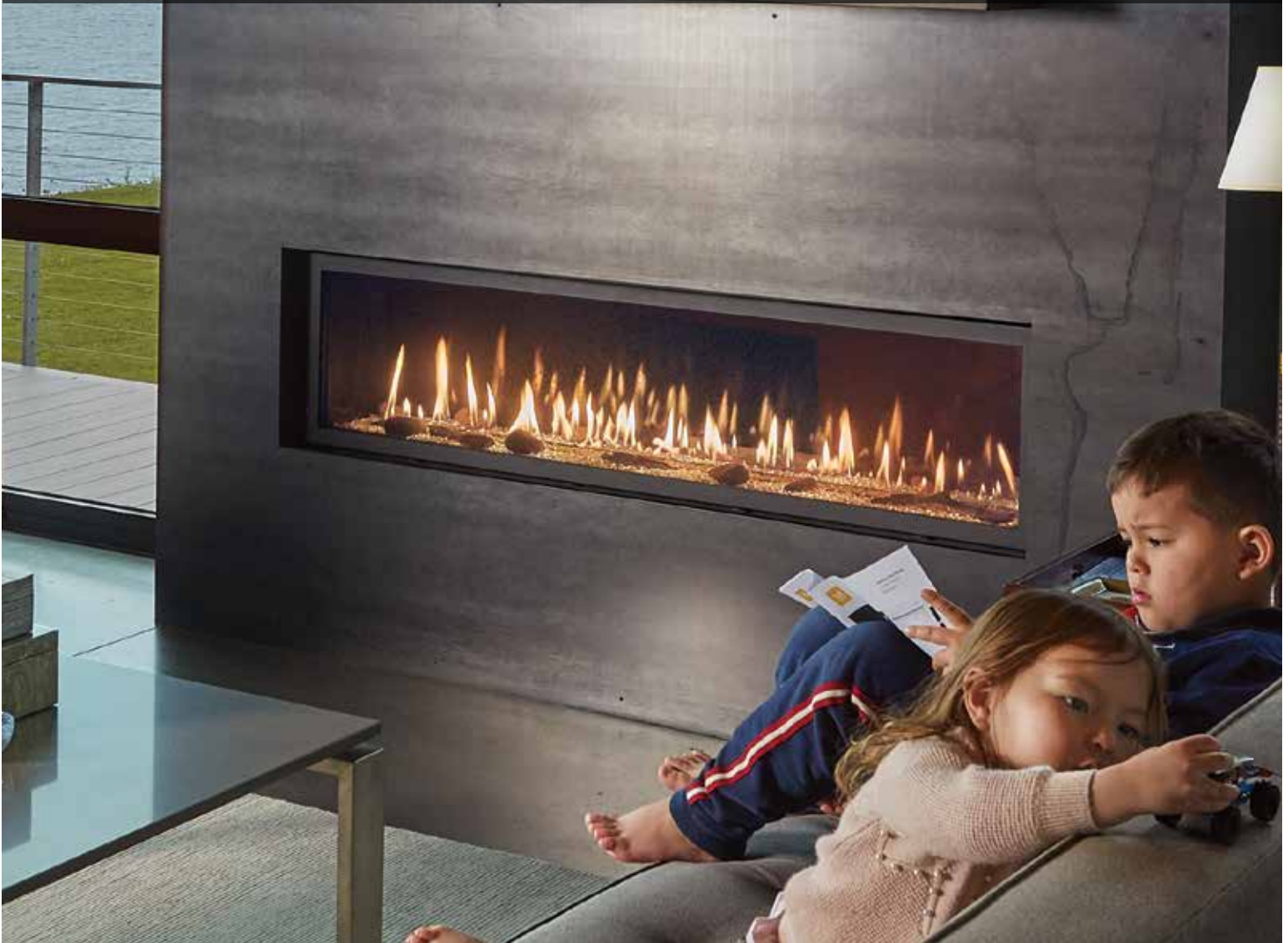
Deluxe 3615 HO Linear