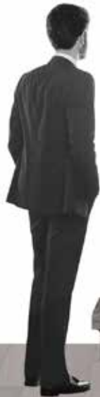
42 Apex NexGen Hybrid