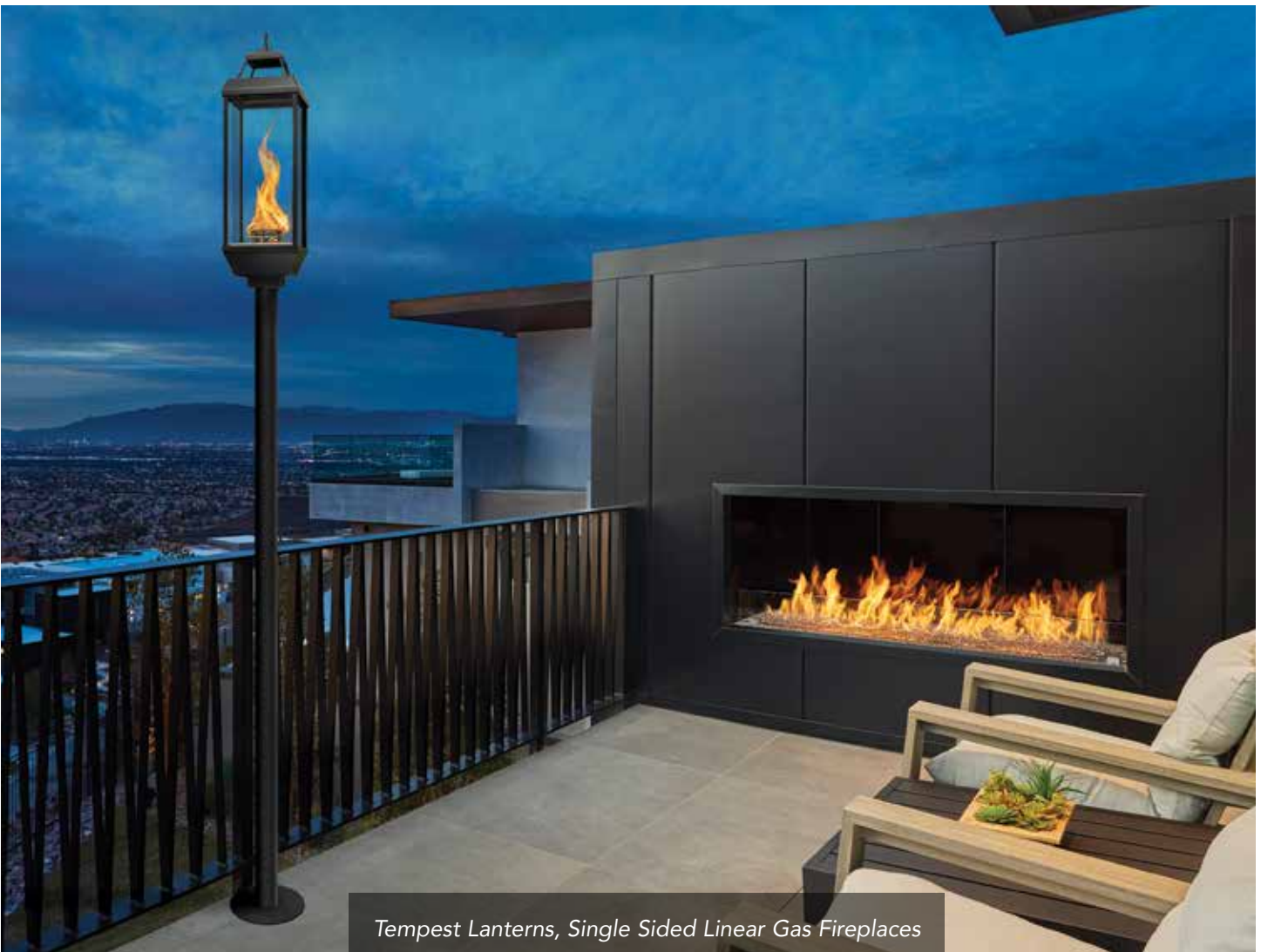
Tempest Lanterns, Single Sided Linear Gas Fireplaces