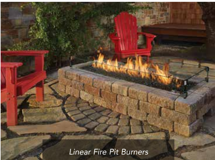
Linear Fire Pit Burners