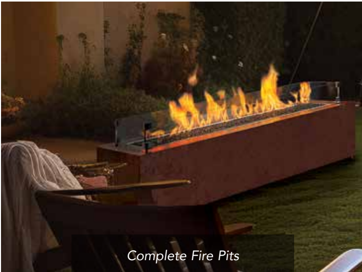
Complete Fire Pits