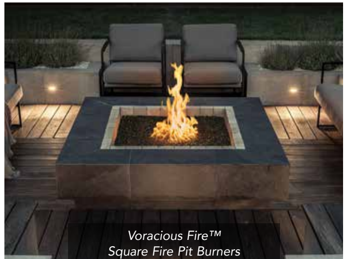
Voracious Fire™ Square Fire Pit Burners