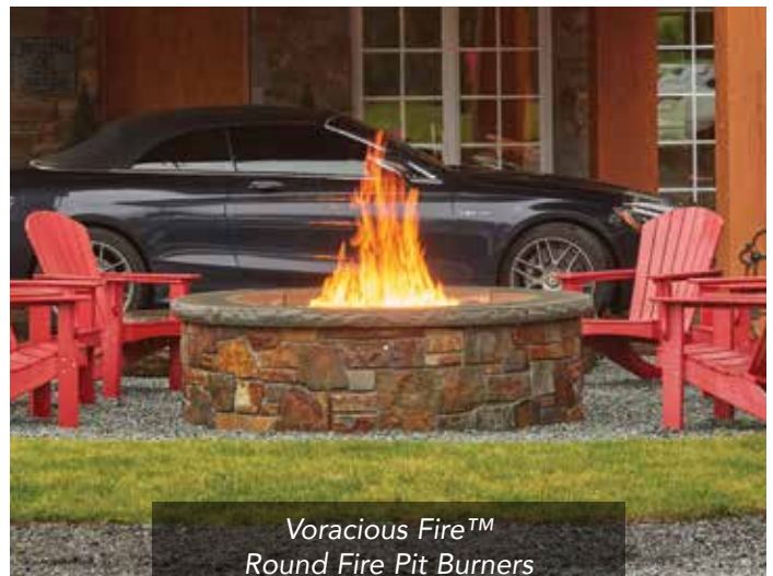
Voracious Fire™ Round Fire Pit Burners