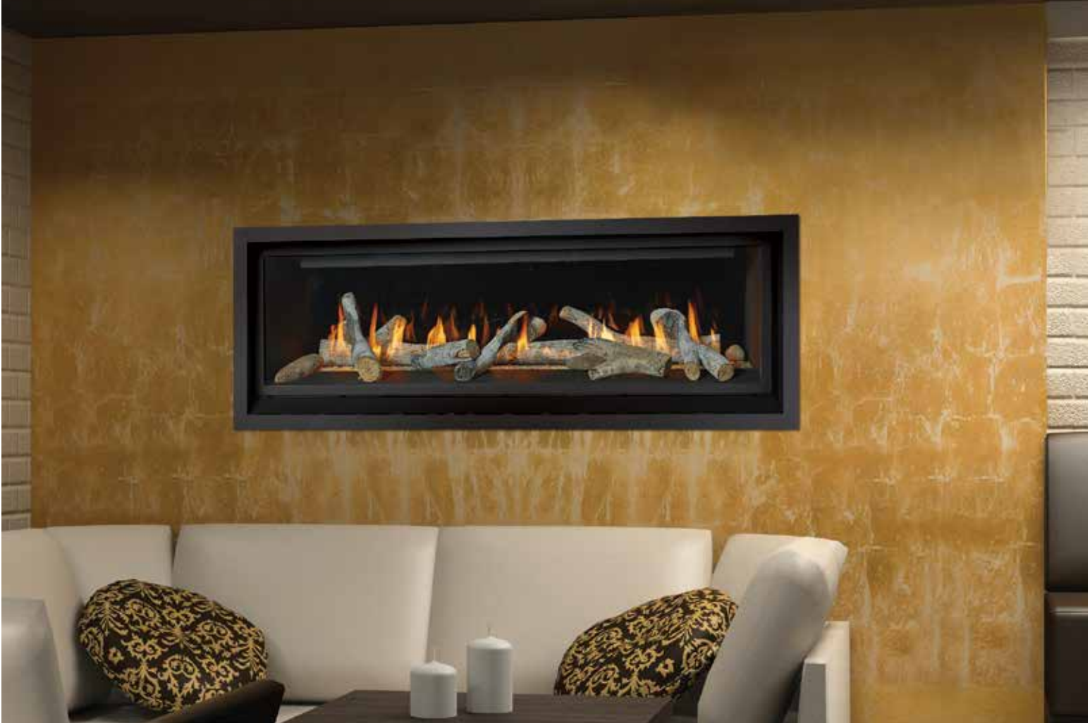
ProBuilder 42 Linear GSB and Deluxe Model