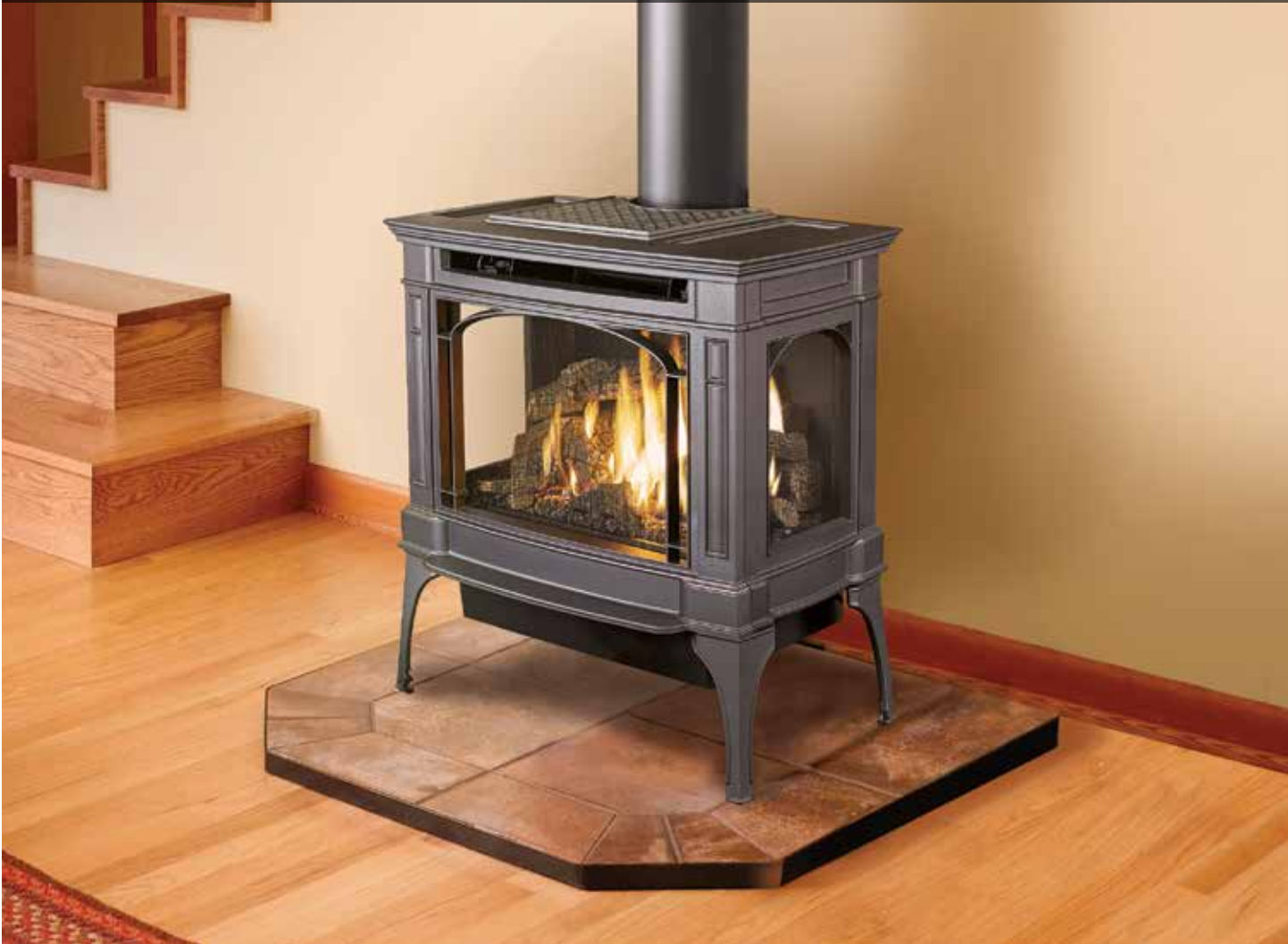
Northfield™ Radiant MV & Deluxe Models