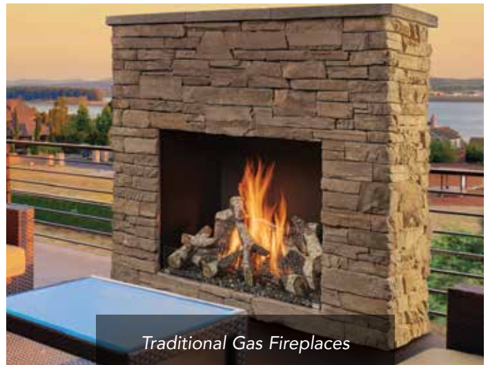
Traditional Gas Fireplaces